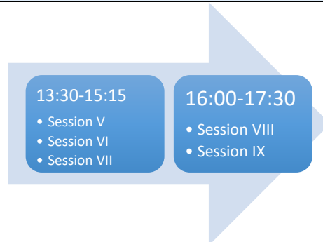
Day 2 – Parallel Sessions